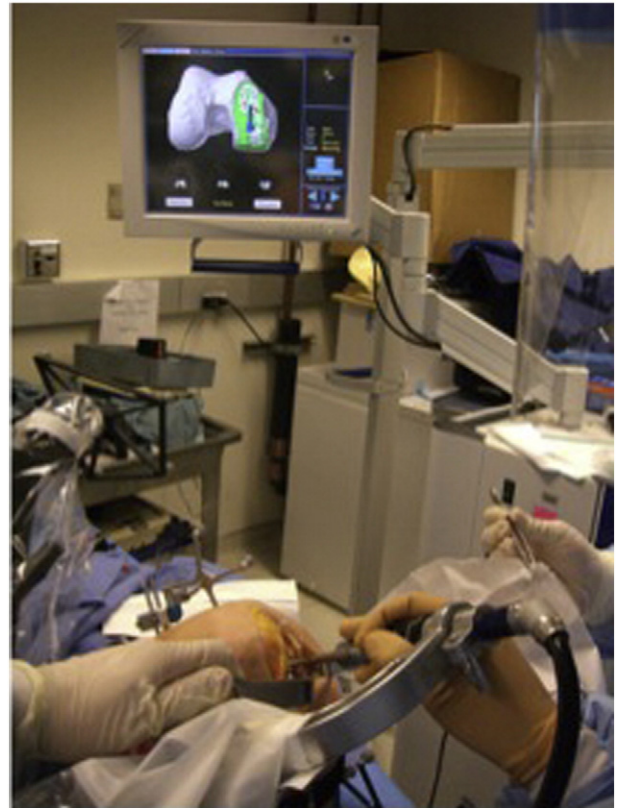
Fig. 1. Experimental setup showing the Tactile Guidance System.

Postoperative CT scans were obtained from all knees with the same scan protocol used preoperatively. Three-dimensional component placement accuracy was assessed by comparing the preoperative plan with the postoperative implant placement in all cases. Utilizing 3D registration, the femoral component position was determined in the same coordinate system as the preoperative plan [21]. Bone and implant models were obtained from postoperative CT scans taken immediately following surgery. The CT scan protocol included 200 slices taken through the knee (approximately 10 cm above and below the knee center) with a maximum slice thickness of 1 mm. Combined bone and implant 3D models were created by segmenting the CT images using active contour models with image intensity threshold filtering (ITK-SNAP, www.itksnap.org ). Some manual editing was required during segmentation to correct contours for streaking artifacts from the metallic implants. Previous research showed that RMS differences between CT-based and laser scan implant position measurements were within 0.8 mm and 0.9° and 0.9 mm and 1.7° in all directions for the femoral and tibial components, respectively [21]. A 3D-to-3D iterative closest point registration (ICP) procedure was performed with commercially licensed software (Geomagic, Geomagic Inc.). The ICP procedure attempts to find the rigid transformation that best aligns a