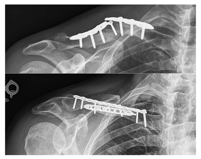
FIGURE 2. Case #15, a 65-year-old male who underwent ORIF of the right clavicle at an outside hospital. He presented 1 year later complaining of fatigue and weakness of his right shoulder. Radiograph at the time demonstrated the broken superior plate and nonunion (above). He underwent removal of the implants, takedown of the nonunion, and revision osteosynthesis with an anterior 2.4-mm locking compression plate and a superior 2.7-mm reconstruction plate (below). Cultures at the time of revision were positive for P. acnes .

had cultures positive for Staphylococcus epidermidis . Of the 2 patients with positive cultures that were regarded as contaminants and not treated with antibiotics, 1 had 1 of 5 cultures positive for an alpha-hemolytic Streptococcus species, and the other had 1 of 4 cultures positive for P. acnes